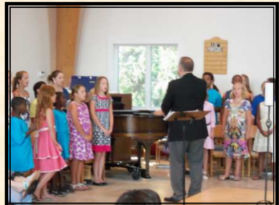
Children's Choir Camp