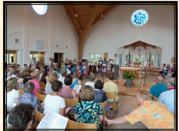
St. Frances By-The-Sea

If any of you like to sing and have been in a choir or chorus in the past maybe you would like to join us. The Choir is a volunteer group that rehearses weekly to prepare for the Sunday service. We meet at Church every Wednesday afternoon at 4:30pm until 6:00pm. Our rehearsals will begin on Sept. 7 th , and we are ready to sing!!